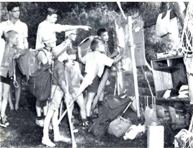
"We planned this canoe trip ourselves."