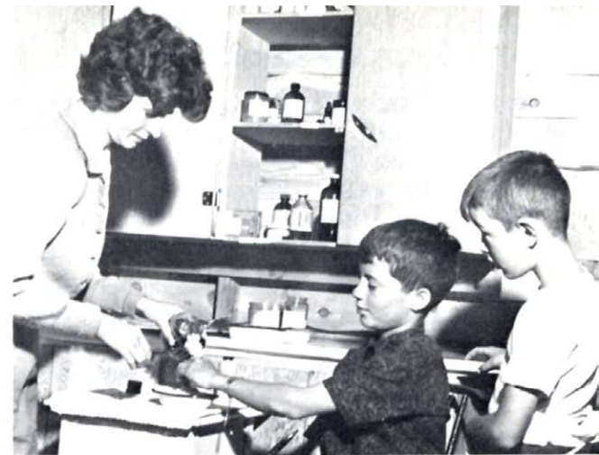
"Is the nurse in?"

Camp Dekka operates on the basic concept that social maturity results from boys living together in small groups with a mature and skilled leader. Campers live in tents or cabins and have every opportunity to initiate and carry out daily activities and projects.