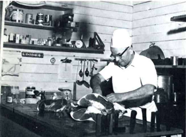
"Boy, am I ready for dinner!"

A modern kitchen and a professional cooking staff plan and prepare high quality meals. Evening snacks are served at the end of each day.